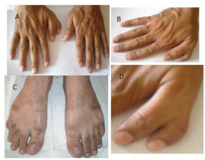
Figure 2. Photographs of hand and feet of Subject III-11 (A, B & D-Extra thumb bifurcating from proximal phalangeal joint in the right hand, C- Feet were normal)

It was evidenced that the subject III-1 was 59 years old and also had extra thumb in his right hand that was also partially developed. The phenotypic and clinical data summery of the family are presented in Table. 2.