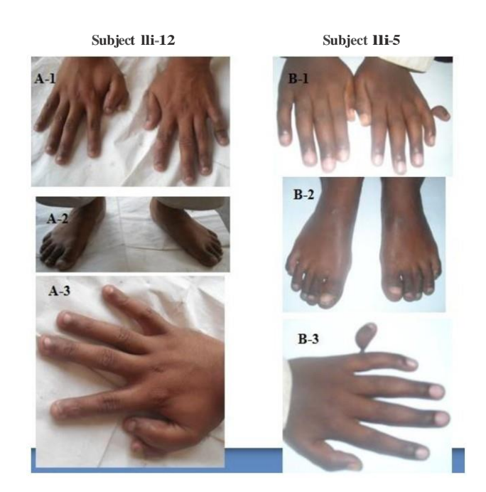
Figure 4. Clinical spectrum of polydactyly in Family II (A1-3- An extra partially grown thumb right hand, A2- Normal feet, B1-3 An extra non functional pedunculated digit in the left hand near small finger in the left hand that was attaches to the hand with the help of small pedicle, B2- Feet are unaffected)